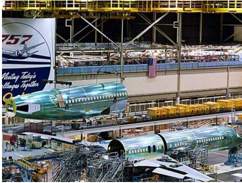
Boeing factory- Renton, Wash. Home of Boeing 737 and 757 production

With customers in 145 countries, employees in more than 60 countries and operations in 26 states, it is not surprising that Boeing has been the world leader in commercial flight for over 40 years.